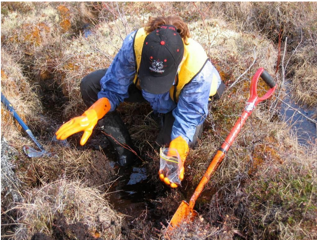
Figure 11.2: Geochemical samples are often small. Wear gloves to protect your skin.