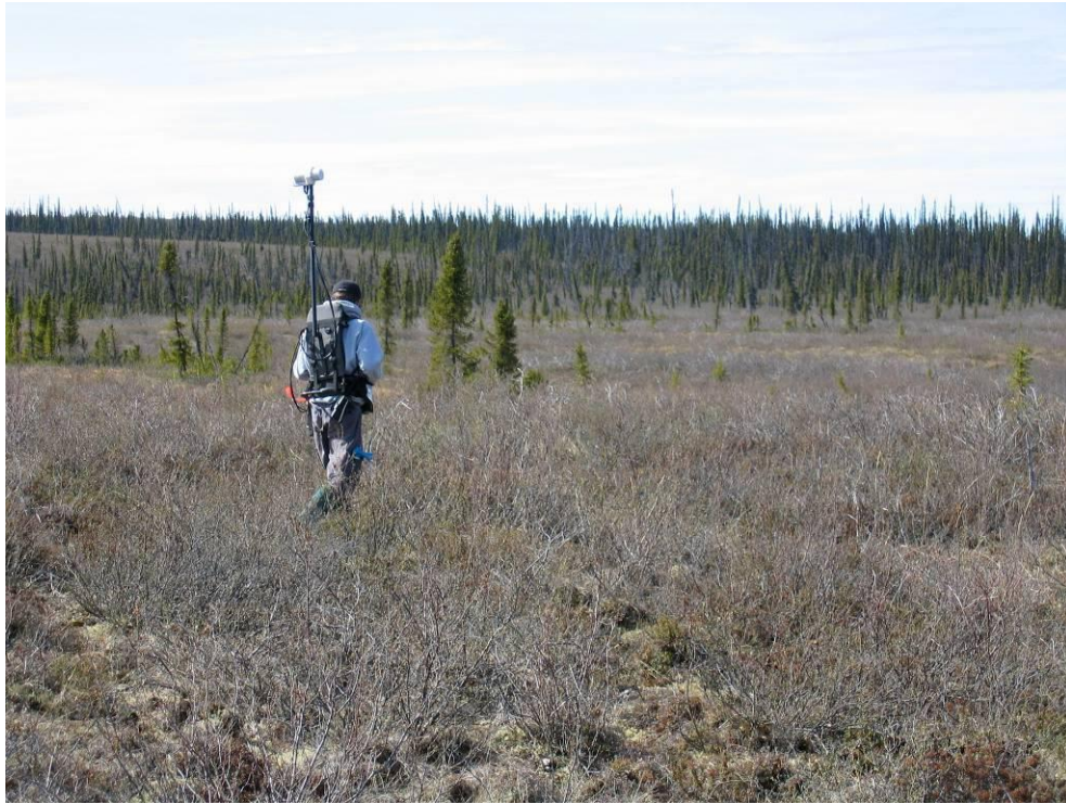
Figure 11.1: Ground magnetic survey traverse